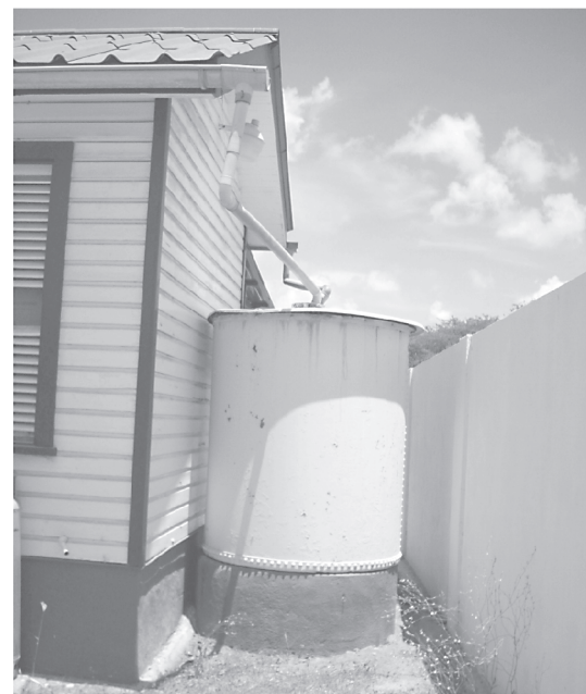
A watertank, still good after over 80 years