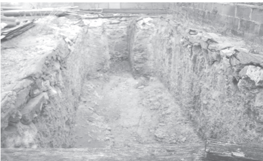
The remains of a bomb shelter