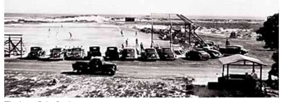
The Lone Palm Stadium

After the colony was built and the fence built and the gate set up(Gate #6 at the sea grape grove) if you did not live in the colony you needed a pass to get in. Passes were issued to people who had friends living in the colony so they could visit, fisherman so they could come to fish, the fishing rights were never stopped and native fisherman always kept boats down by Rogers Beach and of course maids were allowed to come in to work. The hospital in colony was for all employees but it too was segregated, with a wing for the white employees and the rest was for the local employees. People could get a pass to the colony to visit relatives when they were in the hospital.